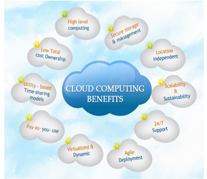
Fig.12 : Advantage of Cloud Computing

Cloud computing is known to be a promising solution for mobile computing due to many reasons (e.g., mobility, communication, and portability [13]). In the following, we describe how the cloud can be used to overcome obstacles in mobile computing, thereby pointing out advantages of MCC.